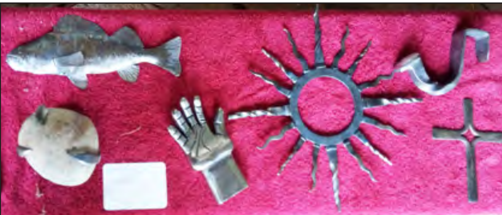
Thank you everyone that helped out with the day! You are what makes being a member of this group great!